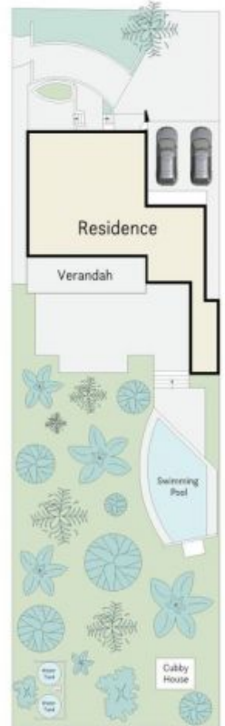
Site plan (not to scale)