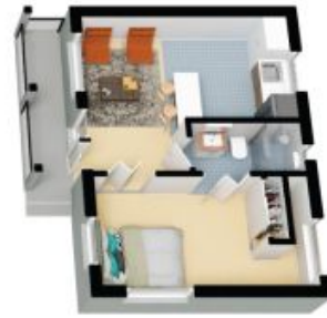
Self Contained Room