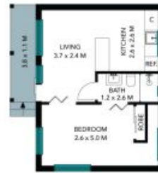
Self Contained Room