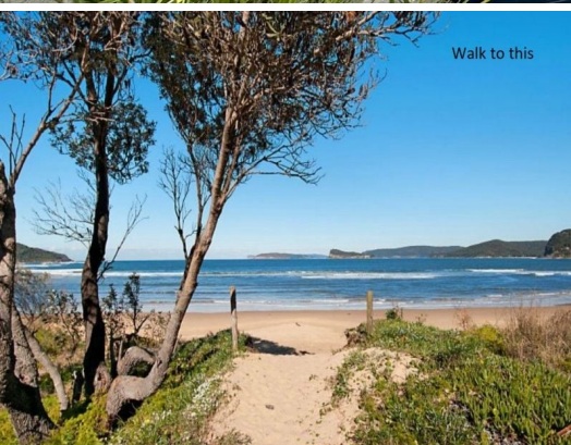
Walk to this