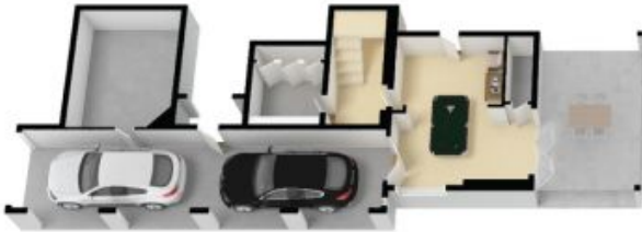
Lower Ground Level