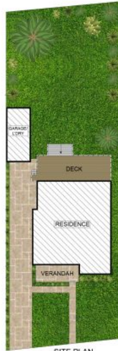
SITE PLAN ( NOT TO SCALE )