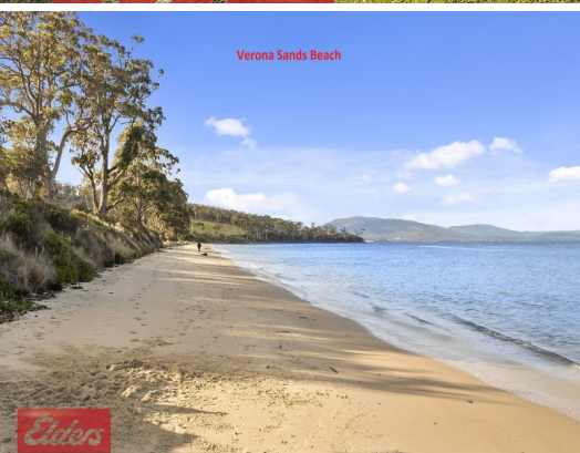
Verona Sands Beach