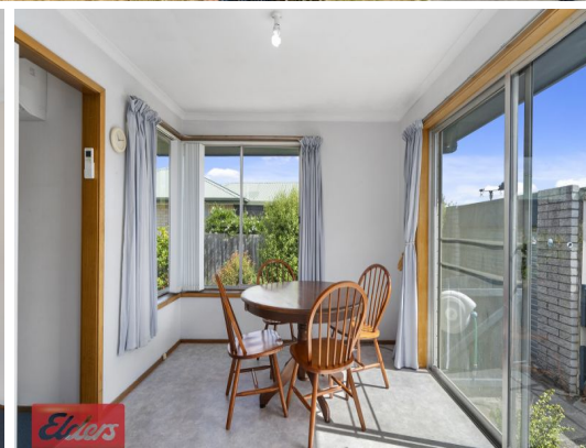
10 Frost Street Snug, TAS