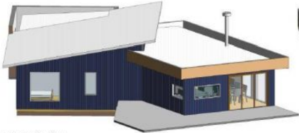
rear study view