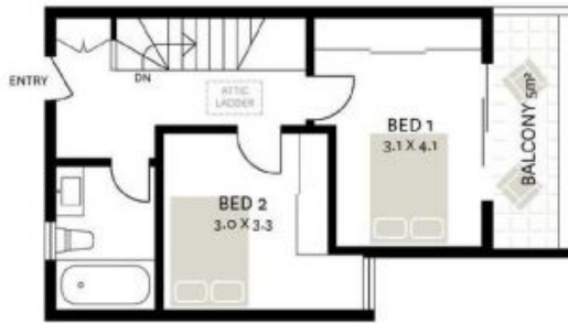
LEVEL 1 (Entry)