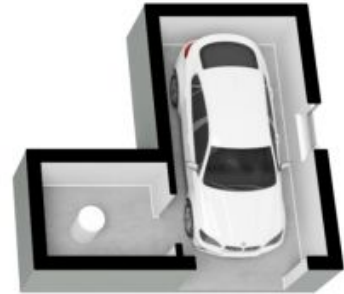
Lower Ground Level