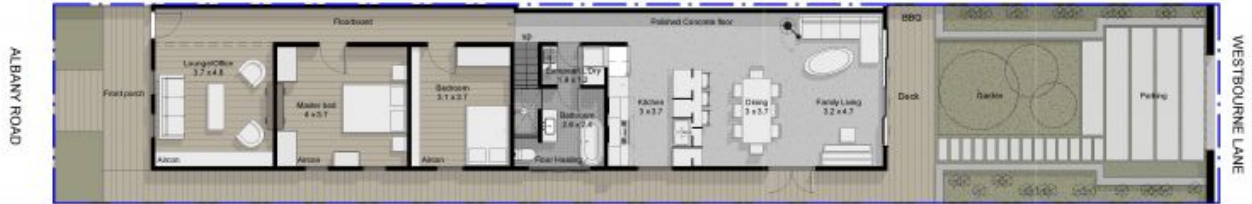
GROUND FLOOR LEVEL 1/100