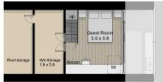
MEZZANINE FLOOR LEVEL 1/100