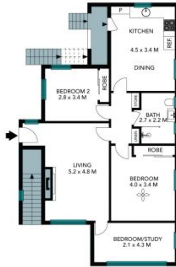
Ground Level (Unit 1)