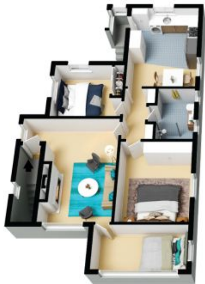
1st Level (Unit 2)