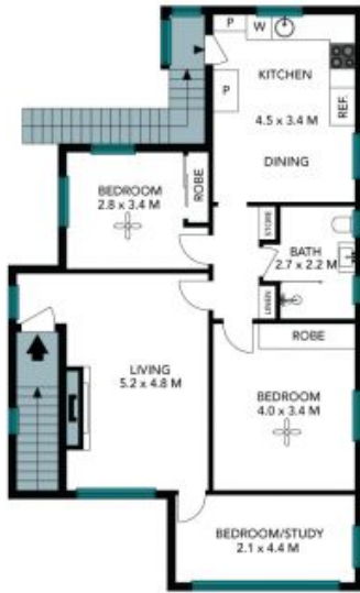
1st Level (Unit 2)