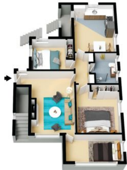
Ground Level (Unit 1)