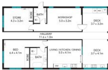
STUDIO (NOT IN POSITION)