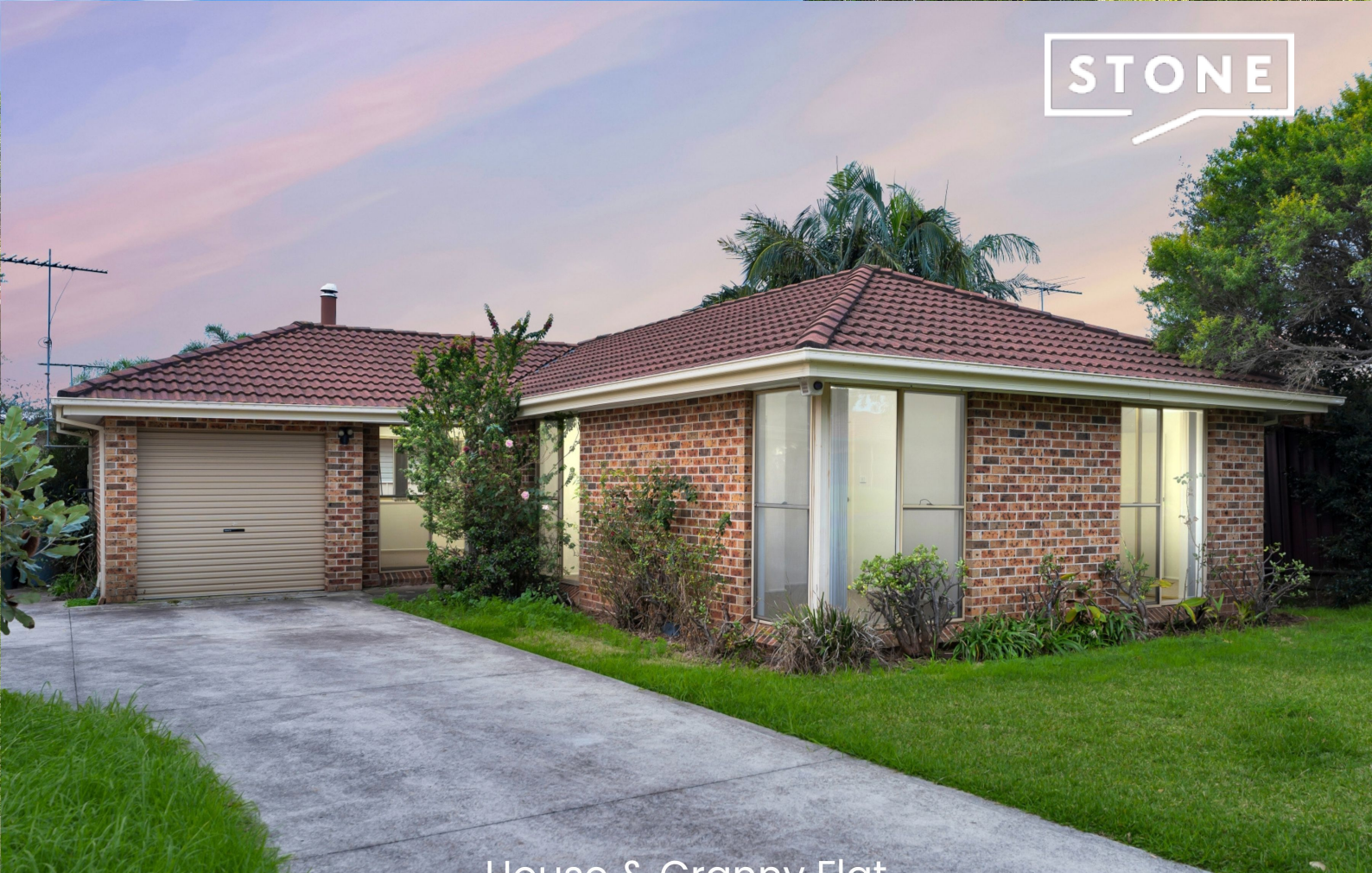
House & Granny Flat