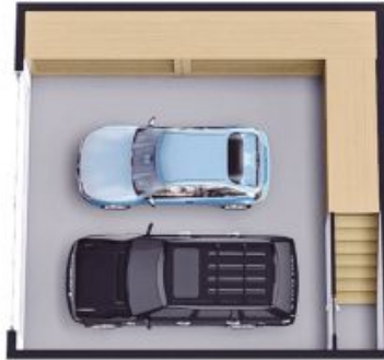
Lower Ground Level