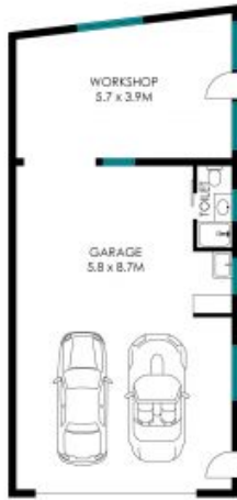
Garage / Workshop