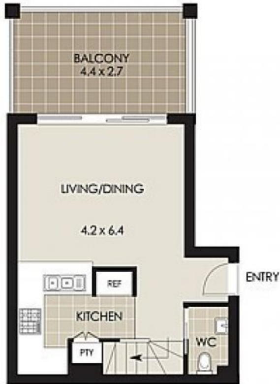
ENTRY LEVEL FLOOR PLAN