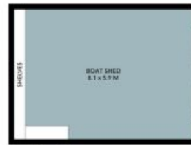
Boat Shed Plan