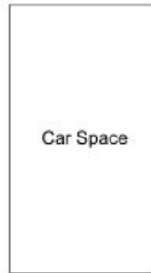
Car Space (Not In Position)