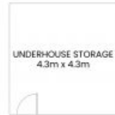
UNDERHOUSE STORAGE 4.3m x 4.3m