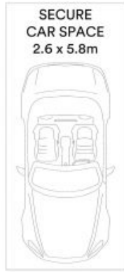
TOP FLOOR (SECOND FLOOR)