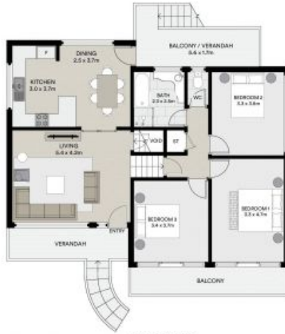
UPPER LEVEL (MIDDLE LEVEL)