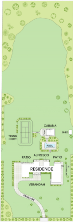
Fox Valley Road