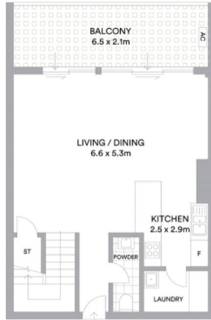
↑ LEVEL FOUR