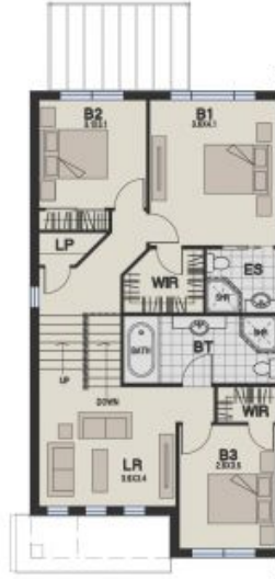
○ FIRST FLOOR PLAN 1:100 UNIT 9,11,18 (10,19 MIRRORED)