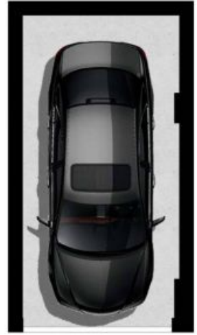
GARAGE 6.2m x 3.1m (NOT ACTUAL LOCATION)