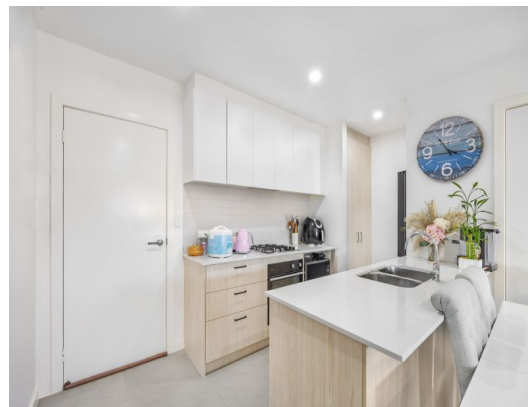
63/60 Kingsland Parade Casey, ACT