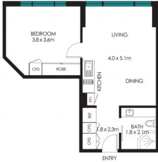
Apartment Floor Plan - First Floor