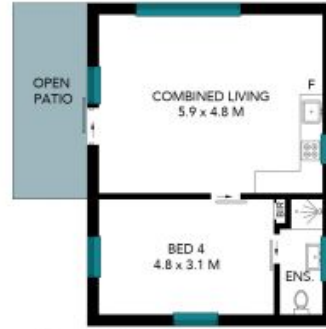
Granny Flat (NOT IN POSITION)

INTERNAL : 177.5 m 2 EXTERNAL : 173.9 m 2