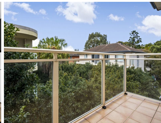
16/14 Jenkins Street Collaroy, NSW 1 1