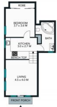
SELF CONTAINED AREA