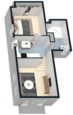
SELF CONTAINED AREA