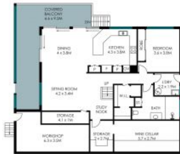
Lower Ground Level