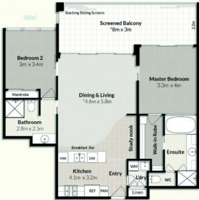
Floor Plan : 232

(Approx. 2.9m x 5.5m) (Position Indicative only)