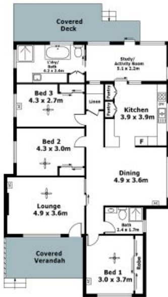
Internal Living Area : 127sqm