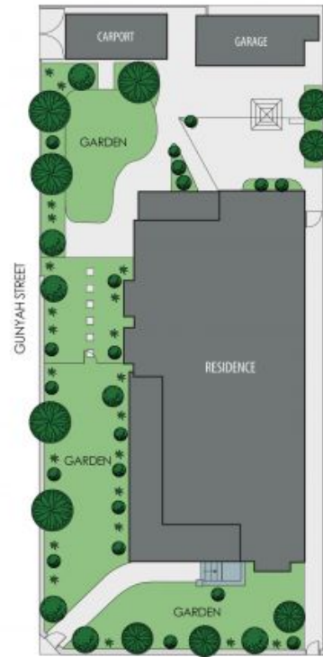
SAILORS BAY ROAD