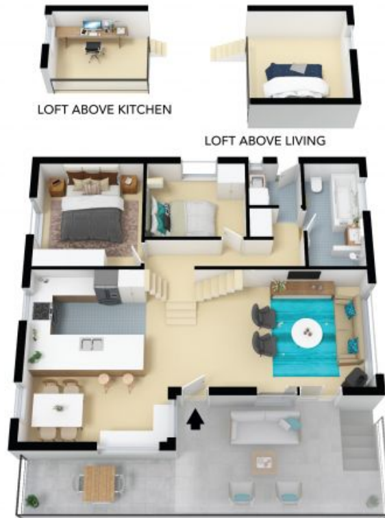
LOFT ABOVE KITCHEN