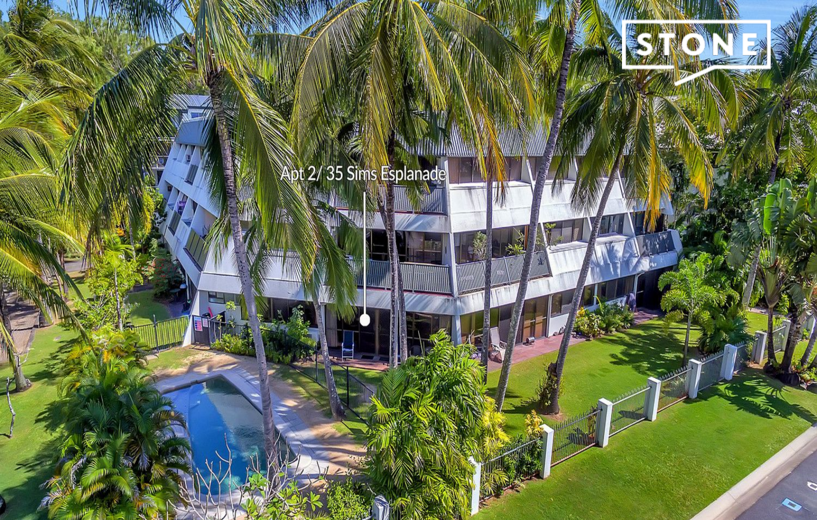
Apt 2/ 35 Sims Esplanade