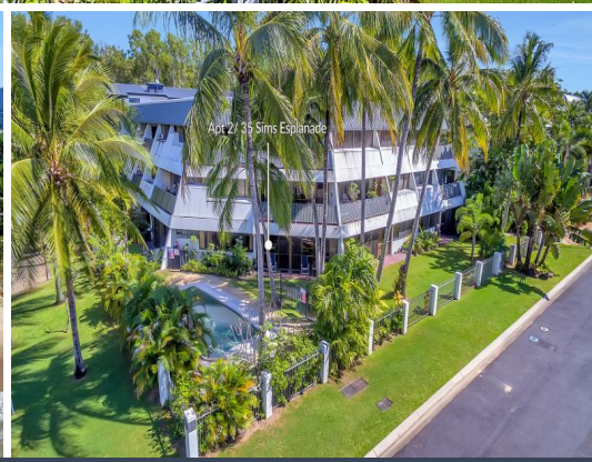
Apt 2/ 35 Sims Esplanade