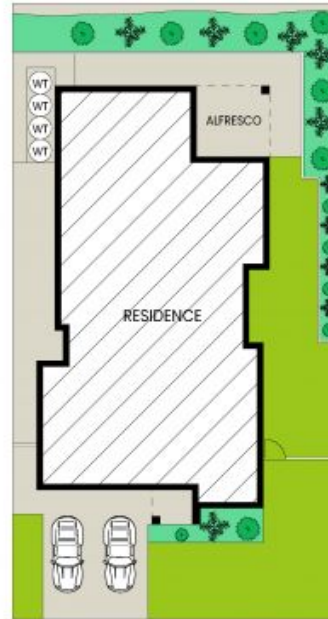
JOHNS ROAD Site Plan

Internal Area: 148 sqm External Area: 13 sqm Garage Area: 34 sqm Total Area: 195 sqm