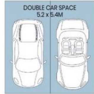
Level Basement Two