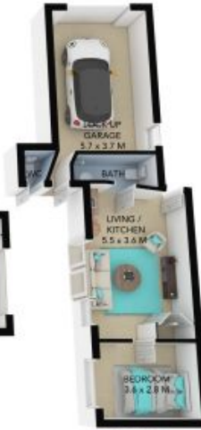
(NOT IN POSITION) Granny Flat