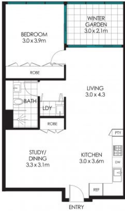
Apartment Floor Plan - Level 9